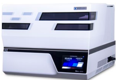
Figure 1 | The BioXp 3200 system, a genomic workstation.

As the scale of genetic analysis has trended away from single-gene studies and toward gene-family, genomic and metagenomic studies, the demand for large-scale DNA-synthesis services and technologies has grown. Moreover, with newer cloning and sequencing technologies, the pace of molecular biology research is accelerating. Synthetic Genomics, Inc., has developed the BioXp system ( Fig. 1 ), available through SGI-DNA, as an in-house laboratory tool to address the increased interest and demand for rapid DNA synthesis. With an assembly module, the BioXp system generates high-quality, linear DNA fragments from custom-designed oligonucleotide pools and reagents across a meaningful section of the complexity continuum in an overnight run. Now, with the introduction of the assembly-and-cloning module, the BioXp system has the additional capability to deliver cloned DNA from a custom DNA sequence in an overnight run ( Fig. 2 ).